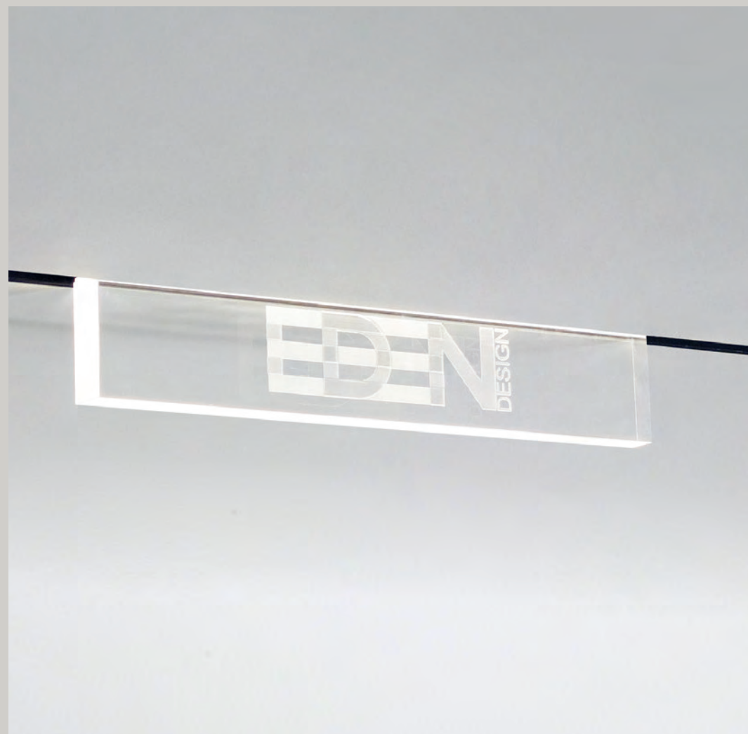
°out with solid clear diffuser with custom etched front (SCE)